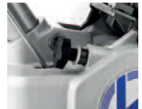
Convenient drum pressure adjustment