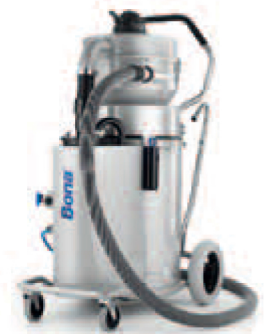
For optimal dust reduction use Bona DCS 70